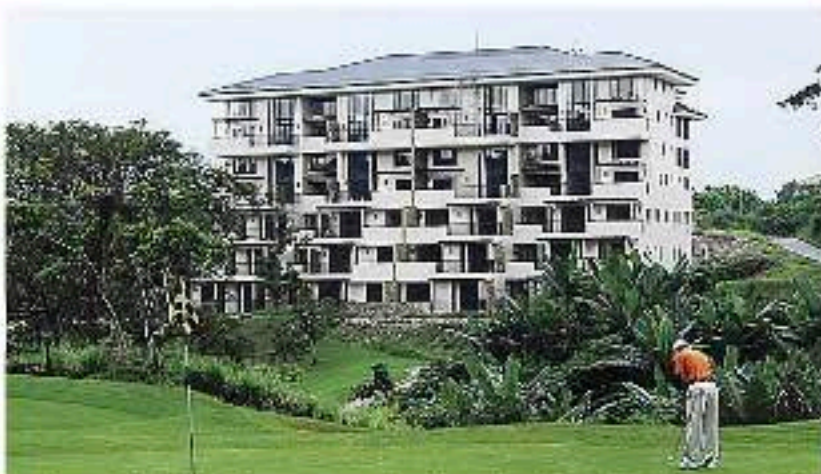
Residents of Golf View Terraces can enjoy views of South Forbes' golf course, lauded as one of the best in the country