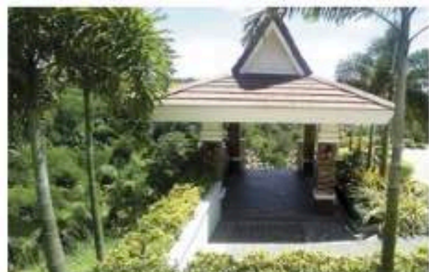
This private retreat is an exclusive amenity for residents of South Forbes Golf City's Nirwana Bali. The township's second Balinese-style village after the highly sought after Bali Mansions, Nirwana Bali.

For a private tour of Nirwana Bali and its dramatic clubhouse, please call 8635-7777 or visit www.southforbes.com .