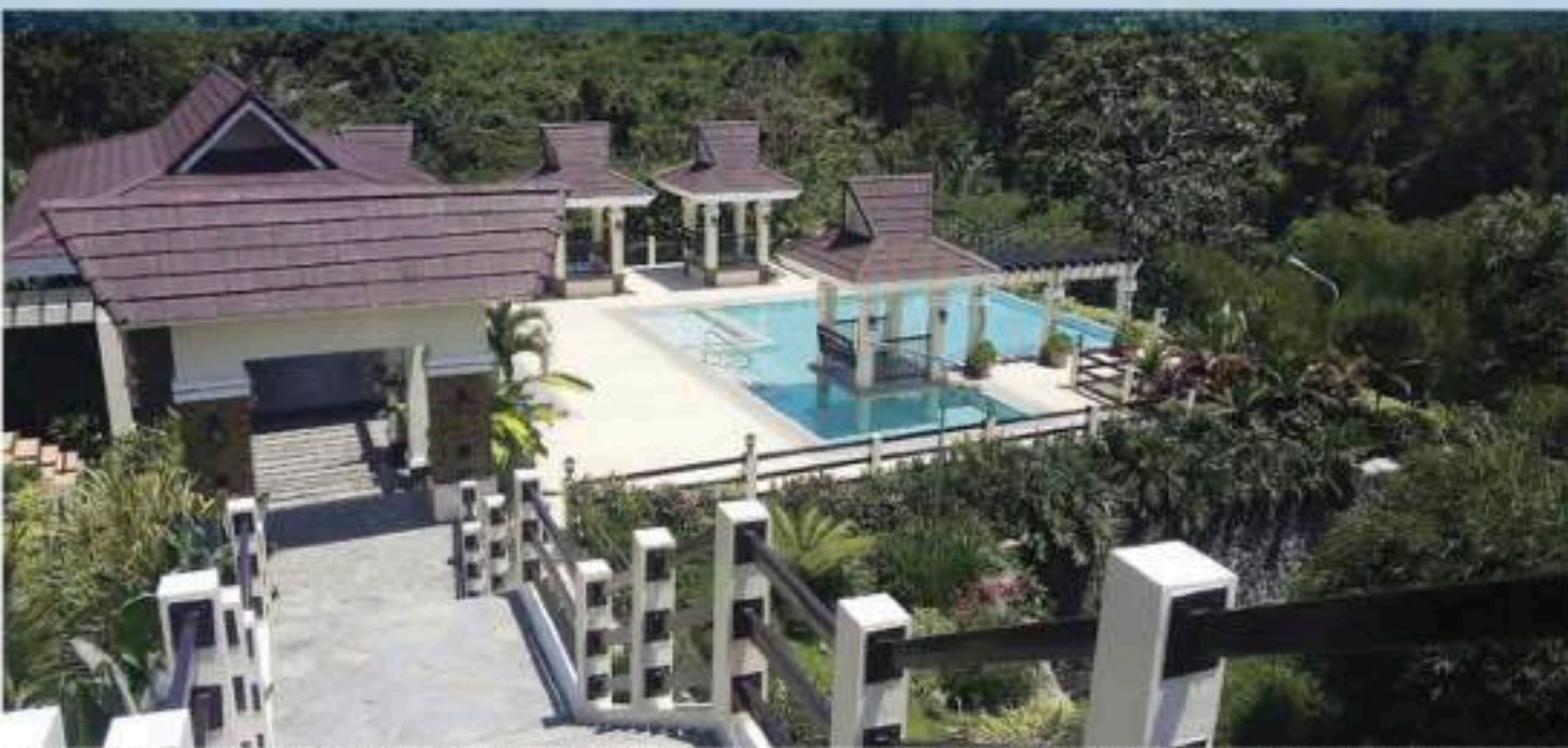
The cliff-side setting of the Nirwana Bali Clubhouse at South Forbes Golf City in Silang, Cavite, lends it a dramatic feel reminiscent of the cliff-top hotel villas in the Island of Bali.

Literally, the effort to traverse the sloping terrain is worth it to reach the Balinese-style tropical resort heaven that this clubhouse offers. Alternatively, residents and their guests can access the clubhouse via the rotunda at the lower