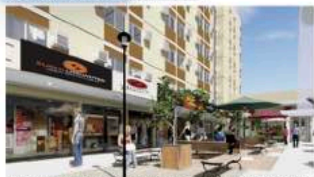
Residents can conveniently shop at commercial establishments located at the ground floor of all condominium developments.