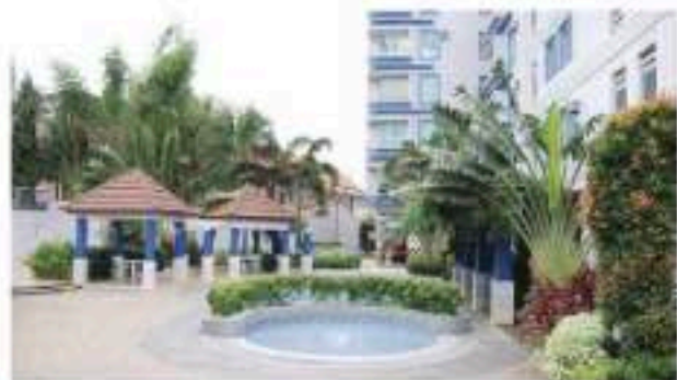
Scandia Suites swimming pool offers a welcome relief to its residences.