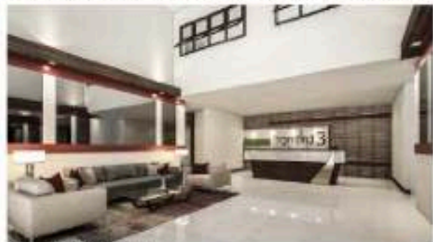
Stanford Suites 3 lobby