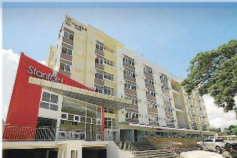
Turn to Page C2 | Stanford Suites offers smart features in its design, amenities and utilities.

Aside from the themed boutique subdivisions that they are offering in Silang, Cavite, Cathay Land Inc. has also brought in South Forbes' mid-rise properties that offer the same modern conveniences of city living in a more relaxed location, and with a cooler climate. The condominium properties of Stanford Suites, Fullerton Suites, Scandia Suites, and Golf View Terraces come as part and parcel of the fast-paced development in the Silang-Tagaytay corridor brought about by the easier access points of the CALAX or Cavite-Laguna Expressway, which has an exit that leads directly to South Forbes. With this new infrastructure development, travel time to Makati or the Mall of Asia