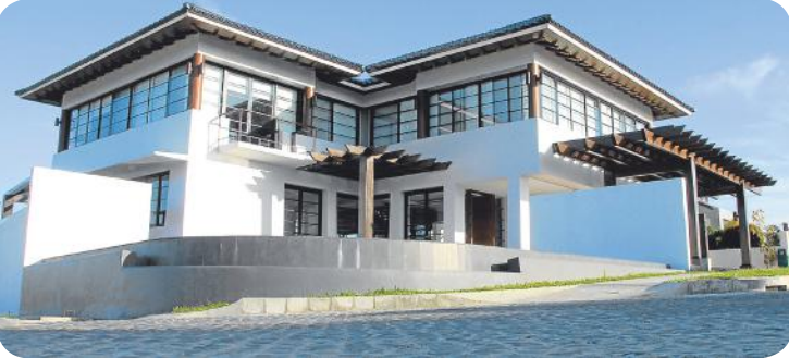
The Meiji at Tokyo Mansions draws inspiration from Japanese architecture.