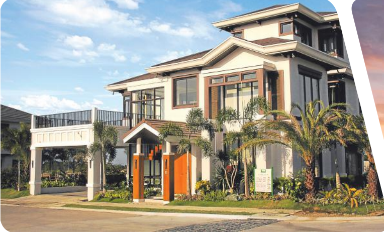
The Nusa Dua at Bali Mansions features a tropical vibe.

In South Forbes, residents are offered utmost exclusivity given the low density in each community; lush greenery and generous open spaces that could help ensure social distancing; a commercial center called Westborough Town Centre to ensure convenient access to your essentials; educational institutions; and an 18-hole golf course amenity, which would allow you to relax and unwind after a grueling work week. Its proximity to other commercial centers and top educational institutions in Sta. Rosa, Laguna, and Silang, Cavite, provide the discerning residents of South Forbes with even more options for their essentials, leisure and entertainment. Its strategic location, too, offers multiple accessibility via major thoroughfares including South Luzon Expressway, the partially opened Cavite-Laguna-Expressway (CALAX) via Laguna Boulevard Interchange, and the proposed Cavite-Tagaytay-Batangas Expressway (CTBEx). However, although location is indeed a significant advantage, work-from-home arrangements have become the norm amid the pandemic and the lockdown. This prompted many discerning