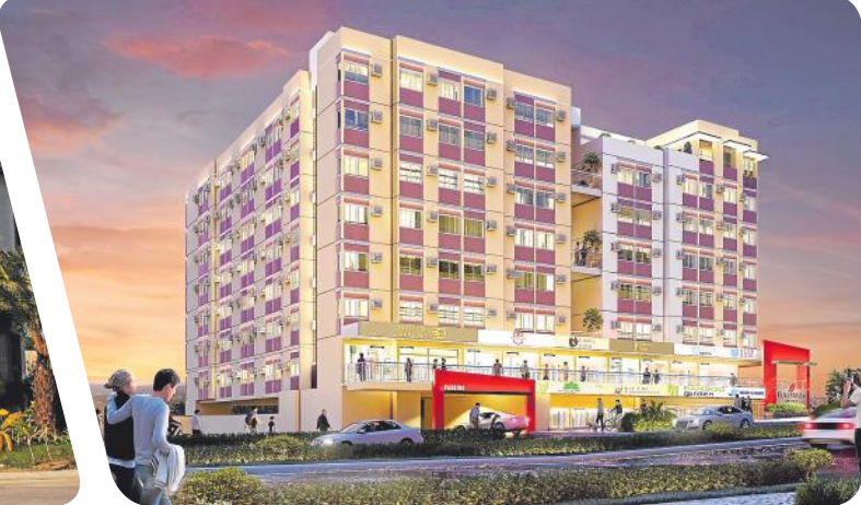
Fullerton Suites is a short walk away from the Chiang Kai Shek College-South Forbes campus.