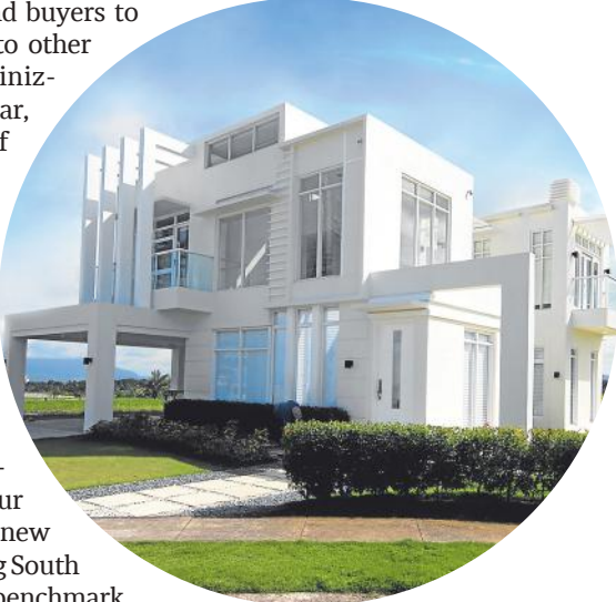
This model unit features a vibrant American style architecture.

homeowners and buyers to start looking into other options—scrutinizing, in particular, the benefits of living in a complete, spacious and green suburban township like South Forbes. All these features, without a doubt, could aptly address all your needs in the new normal, enabling South Forbes to be a benchmark in terms of creating safe and resilient communities that are highly suited to thrive amid and beyond the pandemic. Yet even so, South Forbes continues to grow and evolve to cater to changing demands.