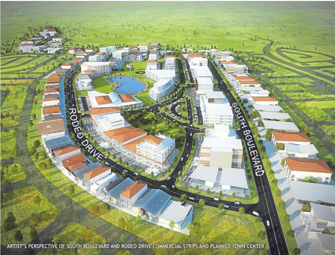
South Forbes Golf City is an innovative township featuring boutique communities with international architectural themes.