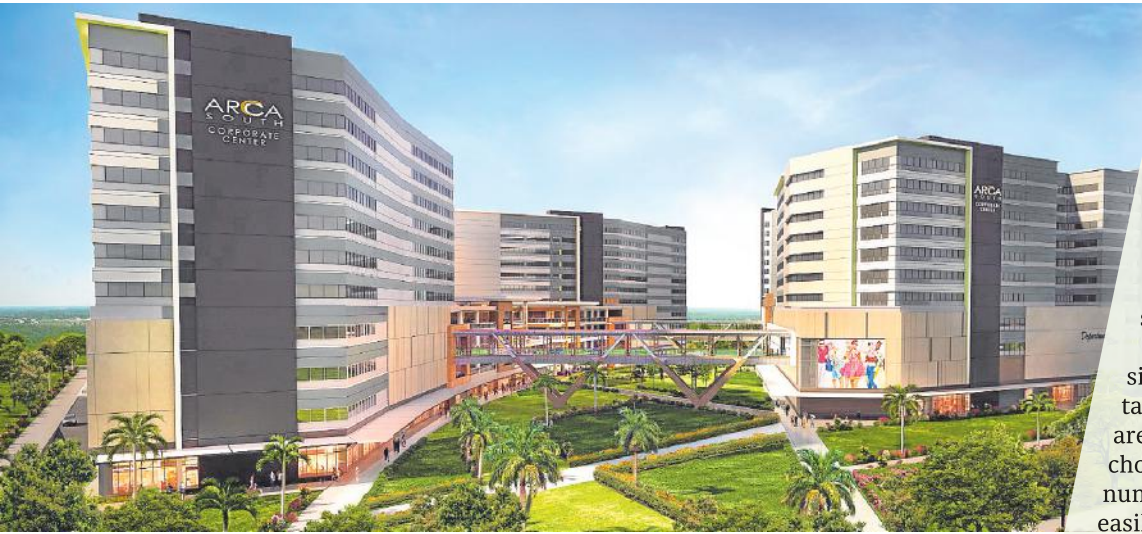
Located in Taguig City, Arca South is a premier business hub that has the advantage of being near numerous transportation routes.

way we live and work in the South, offering convenience, growth and activity in one lush environment.