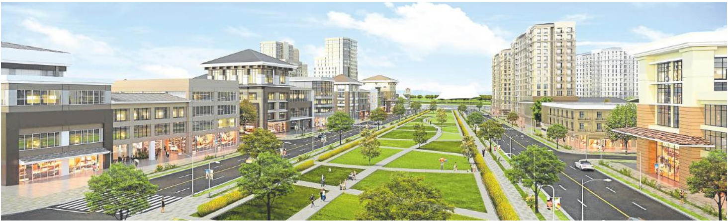
Vermosa in Imus, Cavite, offers a suburban setup with numerous commercial opportunities.

Occupying 725 ha of mixed-use estate, Vermosa is another idyllic location in the South. Located along Daang Hari Road in Imus, Cavite, Vermosa advocates "contemporary active living," by offering outdoor spaces and health venues where one can pursue sports and the fit lifestyle. In particular, the estate is known for the Vermosa Sports Hub, an 8-ha sports complex that features a track oval and field, indoor training facilities and even a sports science laboratory. Vermosa has dedicated 136 ha of land space for offices, institutions and commercial spaces. Known as the Vermosa Midtown, this portion of the estate features commercial lots