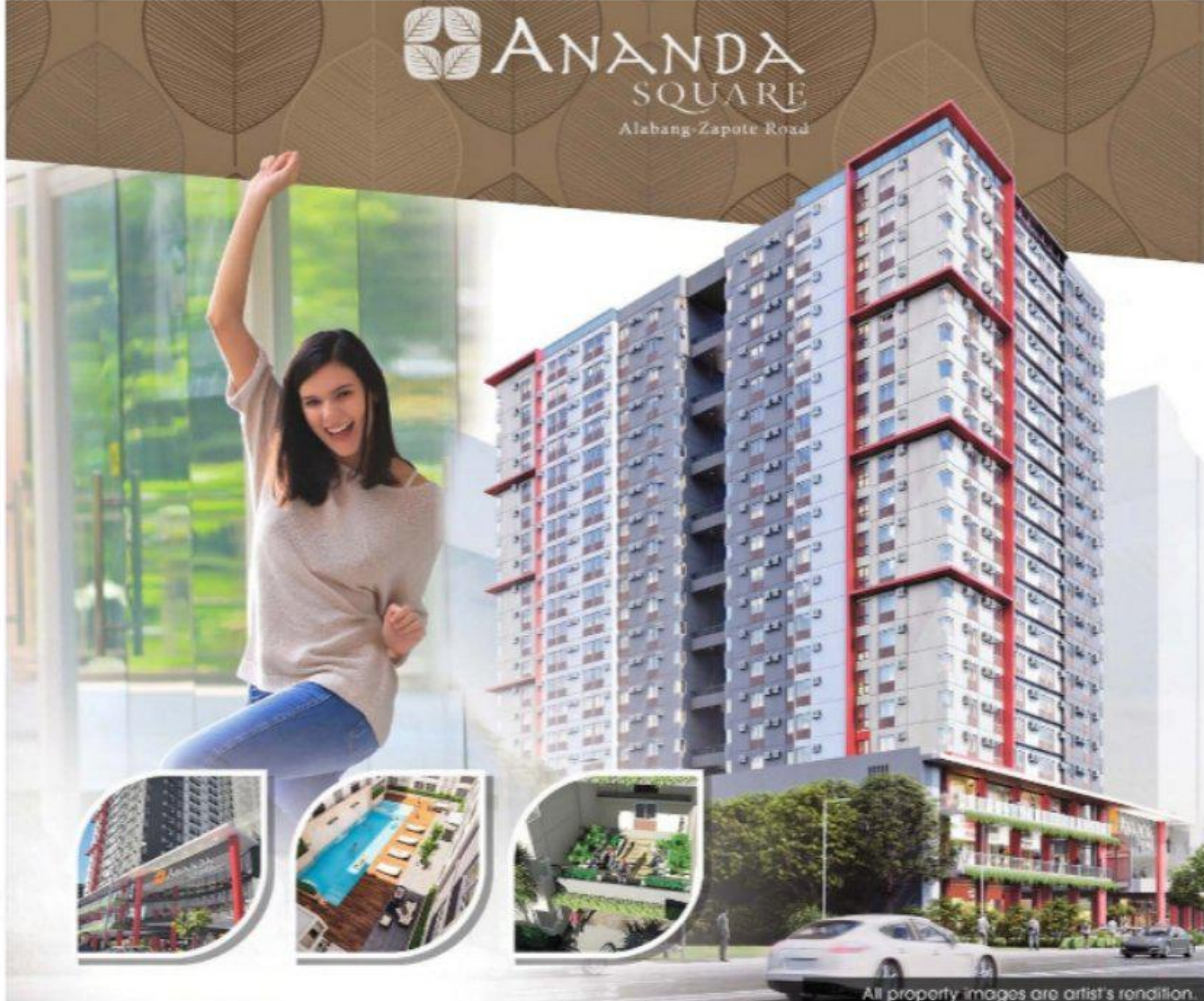
All property images are artist's rendition.